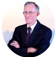
Peter Hime Intellectual Property